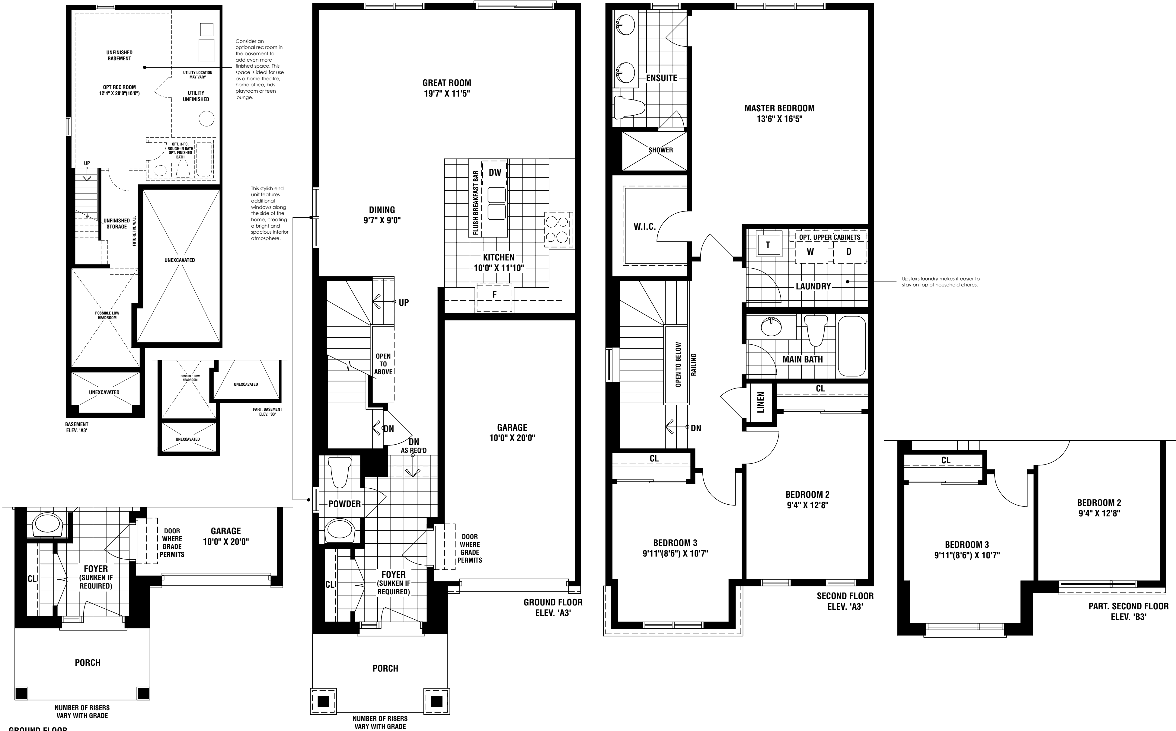
GROUND FLOOR ELEV. 'B3'