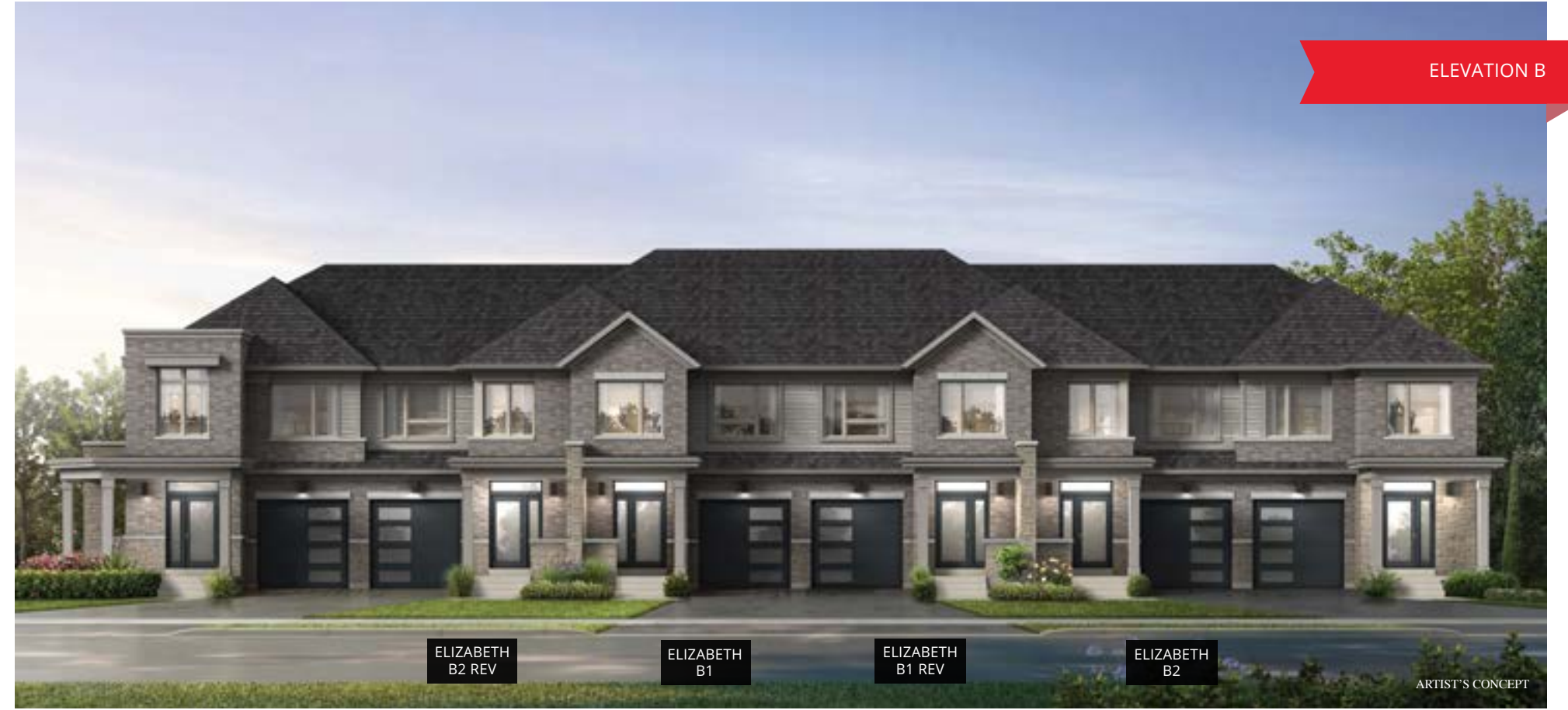
ELIZABETH B2 REV