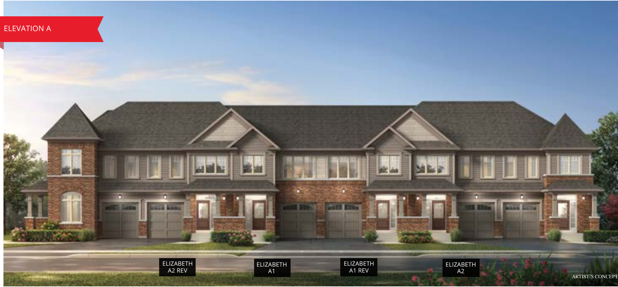
ELIZABETH A2 REV